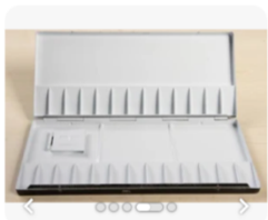
Holbein Aluminum Folding Palette

By the end of the workshop, you will know exactly what your pigment is and how to use them.